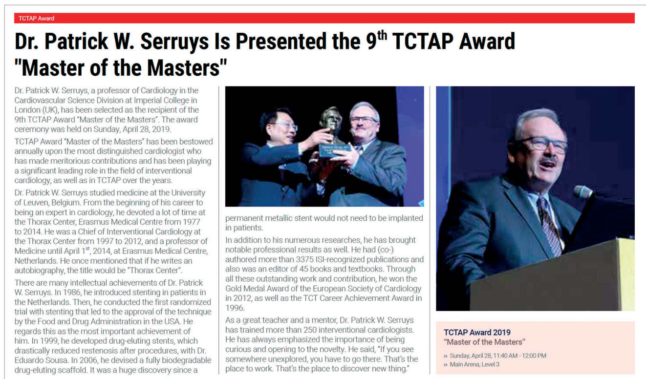
Figure 3. TCTAP Award 2019 "Master of the Masters".